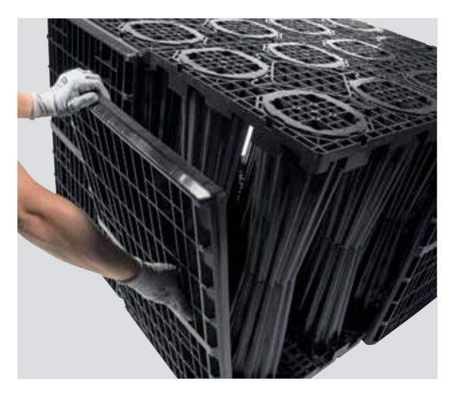
Polypropylene side panels are added to the perimeter of the tank to give lateral support against surrounding soils. The side panels have cutting guides which can be cut out using a jigsaw for the connection of plastic pipes.