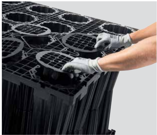
Polypropylene top covers are added to the top layer of the tank to fill the openings of the pillars and to ensure consistent support for the cover fill material.

Note: Top covers are only placed in the top layer of the tank before the geomembrane and/or geotextile is wrapped around them.